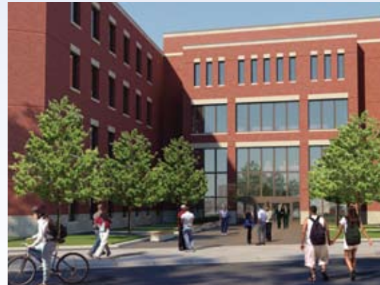
The new 191,000-square-foot academic center, to open in 2011, will be LEED gold certified.